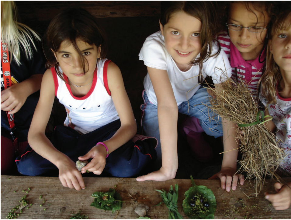
Figure 1. Udeskole takes place outside the formal boundaries of the school.