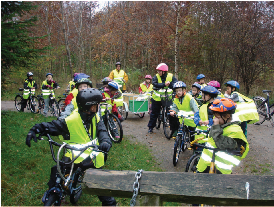
Figure 2. Promoting physical activity and healthy lifestyles.

that the combination of classroom and outdoor teaching had a positive effect on the children's social relations, experience with teaching and self-perceived physical activity level (Mygind 2008, 2005).